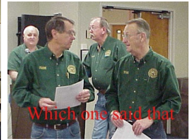
Which one said that