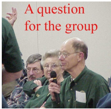
A question for the group