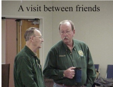
A visit between friends