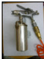
Badger 400 No Longer Available

used for model building or touch-up painting on automobiles, the Badger 400. The Badger has a larger siphon cup for bigger jobs. Iwata and Sata make high-quality detail sprayers but expect to pay over $300.