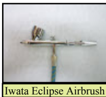
Iwata Eclipse Airbrush

I bought an Iwata Eclipse HP-CS from Coast Airbrush for about $125. This brush has a gravity-feed cup on top instead of a siphon feed below. Also, a bigger needle-nozzle set is available to