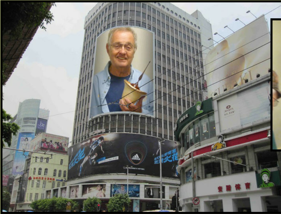
The man can sure draw a crowd!