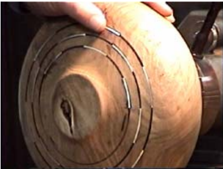
One of Charles' "work-in-progress" inlaid turnings.