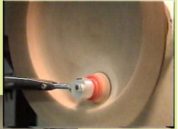
Assembled Pieces & Sanding Acc. by Norm Dixon