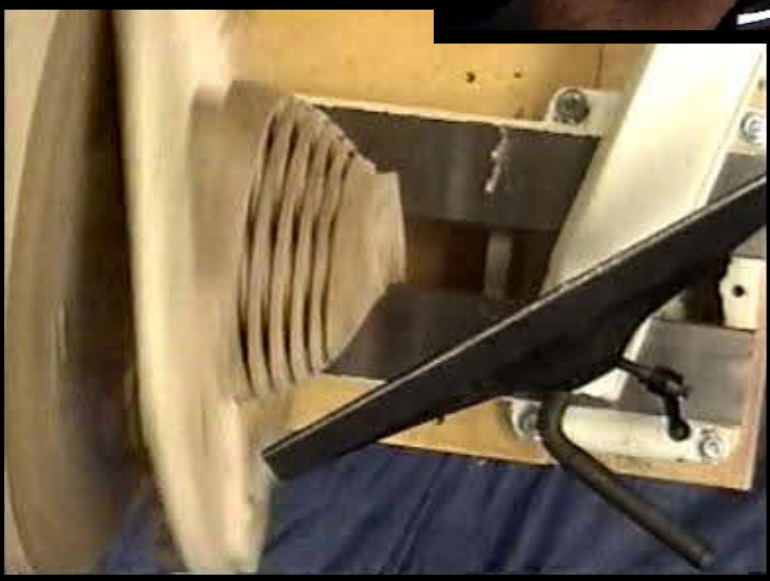
Creating Special Effects By Charles Brooks