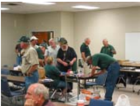
Brisk raffle ticket sales in October