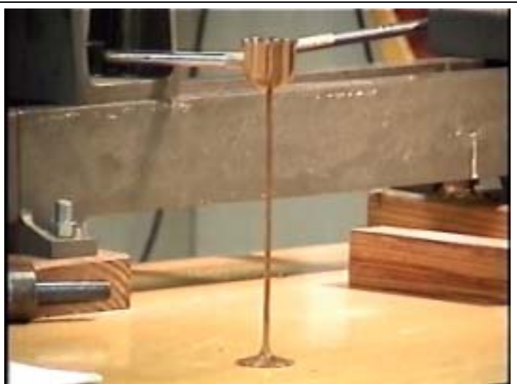
One of Andy's thin-stemmed goblets from Tulipwood