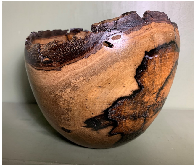
Worth Holmes Persimmon bowl 7" x 7" tall